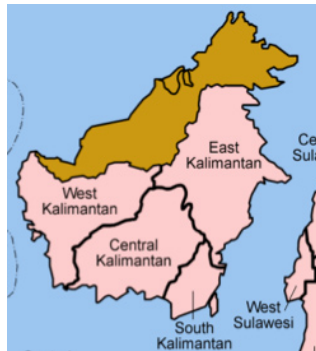
Figure 1. Indonesian provinces on Borneo

Until recently, Project POTICO has been concentrating its efforts in the Indonesian province of West Kalimantan on the island of Borneo (Figure 1). Among other steps, WRI and its Indonesian project partner Sekala have developed a method for identifying degraded lands that are physically suitable, economically viable, socially acceptable, and legally available for oil palm plantations. They mapped suitable and viable tracts of degraded land across the