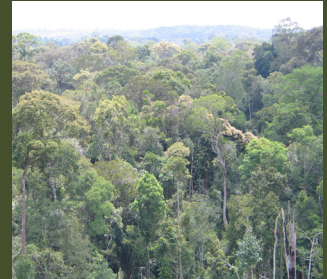
Forest slated for conversion to oil palm plantation in Indonesia

In 2009, the World Resources Institute (WRI) launched Project POTICO (palm oil, timber, carbon offsets) with support from NewPage Corporation. Project POTICO